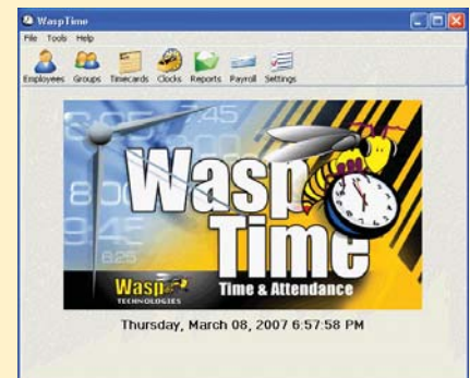
▶ Main Screen

WaspTime solutions provide business owners, HR and payroll administrators an easy way to gain control of employee time.