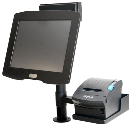
Various mounting ability for versatility and convenience

Providing Superior User Safety and Peace of Mind.