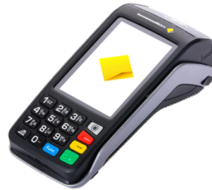
Card Pin Pad