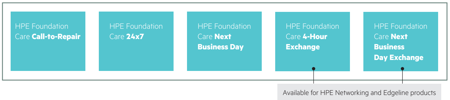
Figure 1. HPE Foundation Care—services levels

Collaborative Support for x86 servers that simplifies the support experience and saves time by helping resolve issues faster. If your infrastructure is based on industry-standard servers, you're likely to have a number of third-party software licenses, and run multiple operating systems and virtualization technologies. That's why we have included Collaborative Support with hardware support for x86 platforms. Collaborative Support will help save your time giving you a single point of contact for issue diagnosis, troubleshooting, and application of known solutions—even if you did not buy the software license from Hewlett Packard Enterprise.