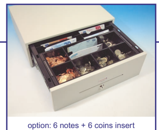
option: 6 notes + 6 coins insert