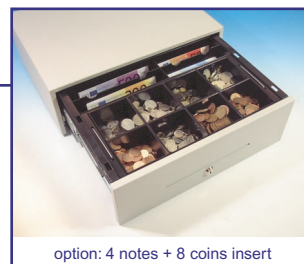
option: 4 notes + 8 coins insert