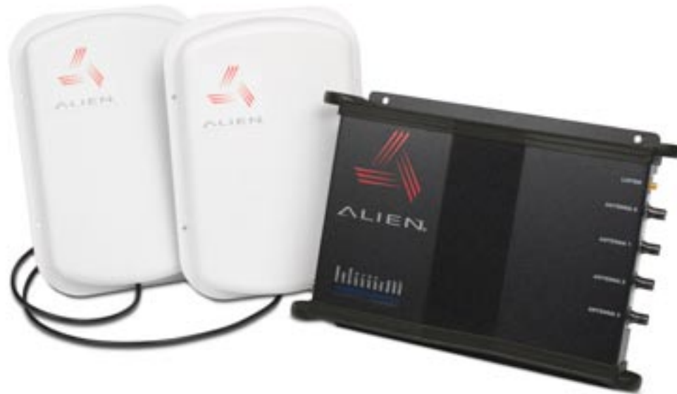
Figure 1: The ALR-9800 is available with linear or circular antennas