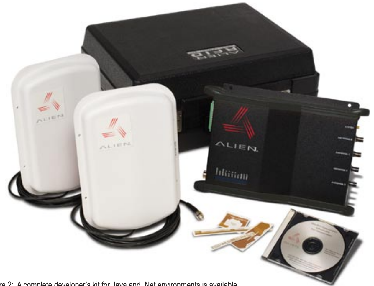
Figure 2: A complete developer's kit for Java and .Net environments is available.

Upon restoration of power after a power loss, the ALR-9800 resumes its previous configuration and operational mode. A tag list of up to 2500 tags may be stored in non-volatile memory.